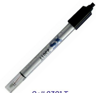
Cell 2301 T