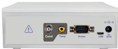
Connections COND 60 VioLab