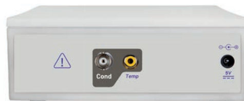
Connections COND 50 VioLab

The LED indicator allows you to keep always under control the state of the measurement