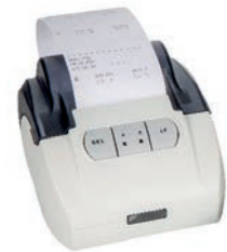
RS 232 printer